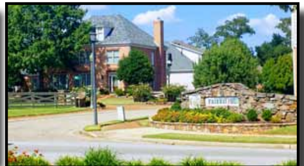
23 STONE FLOWER BED WALLS