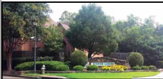
21 ENTRANCE SIGNS