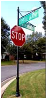
44 STREET SIGNS